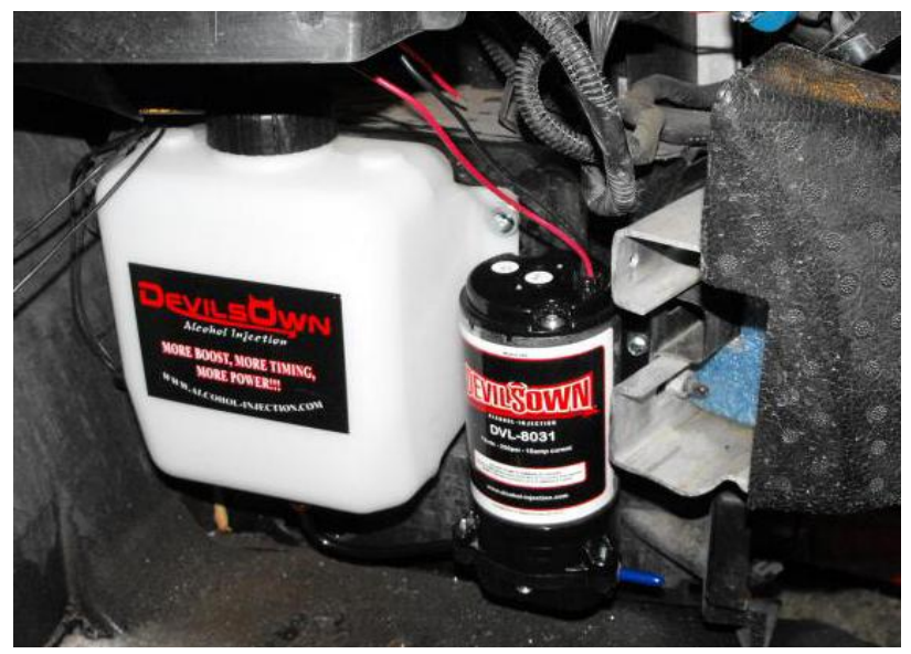
Figure 2: Pump placement

The DevilsOwn pump should be mounted below and as close to the reservoir (tank) as possible using four of the #10 \times 1\frac{1}{2} " screws. Make sure to mount the pump away from heat, moisture and road debris. On top of the black pump housing, there are two arrows indicating the direction of fluid flow to and from the pump. The port with an arrow pointing towards the pump housing is the pump inlet (suction) from the reservoir. The port with an arrow pointing away from the pump housing is the pump outlet (pressure) which goes to the solenoid.