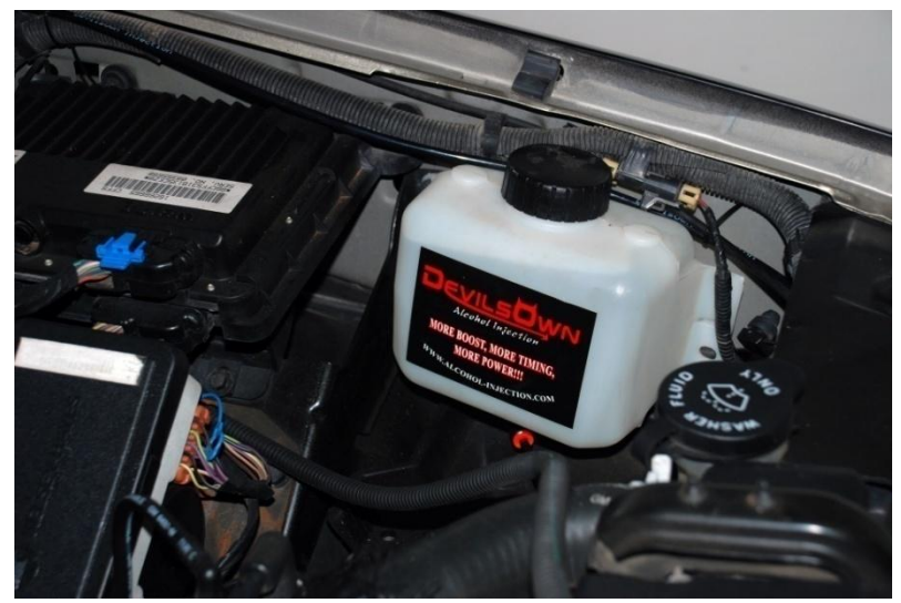
Figure 1: Tank Placement

Remove the factory washer fluid tank from the car, if possible, for ease of access. On a flat side of the tank, locate a place for the self sealing bulkhead fitting that is free of obstructions. (The best and recommended spot is either the side or the front of the tank.) Using a 7/8" drill bit, drill a hole in a flat location and simply place it in and hand tighten. In order to maintain a leak-free seal, this must be done on a flat area. DO NOT place the tank tap in the seam line of the tank. Doing so can cause leaks.